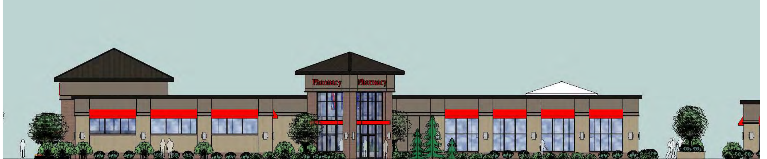
ENTRANCE ELEVATION (EAST)