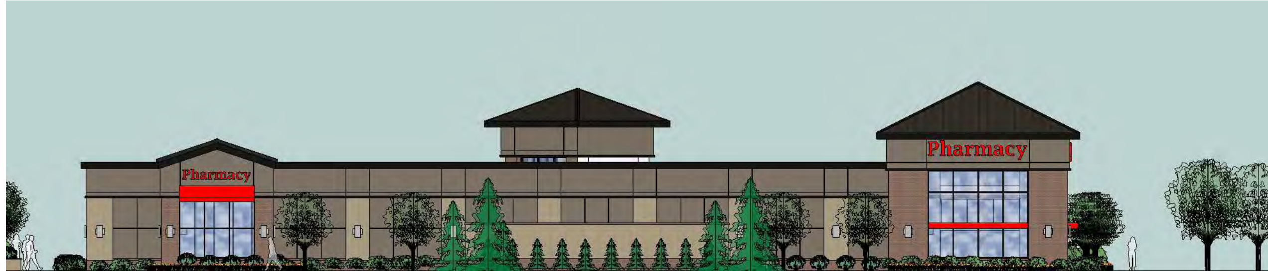
HAMILTON ROAD ELEVATION (WEST)